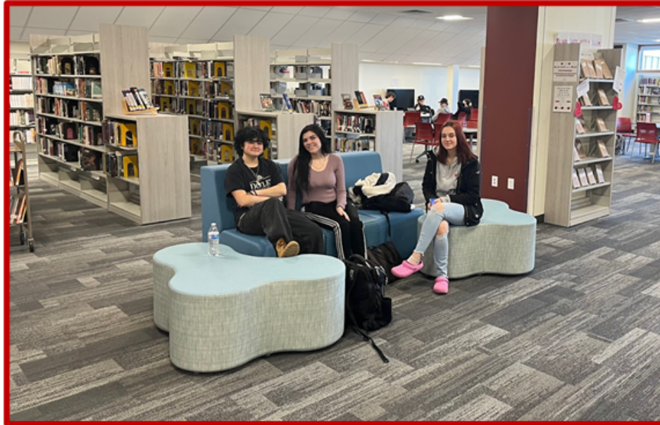
DHS students enjoying the new flexible learning spaces in the recently renovated library.